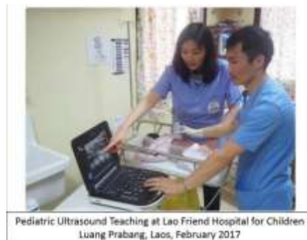
Pediatric Ultrasound Teaching at Lao Friend Hospital for Children Luang Prabang, Laos, February 2017