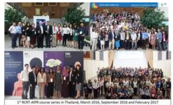
1st RCRT-AIPR course series March 2016, September 2016 and February 2017, Thailand