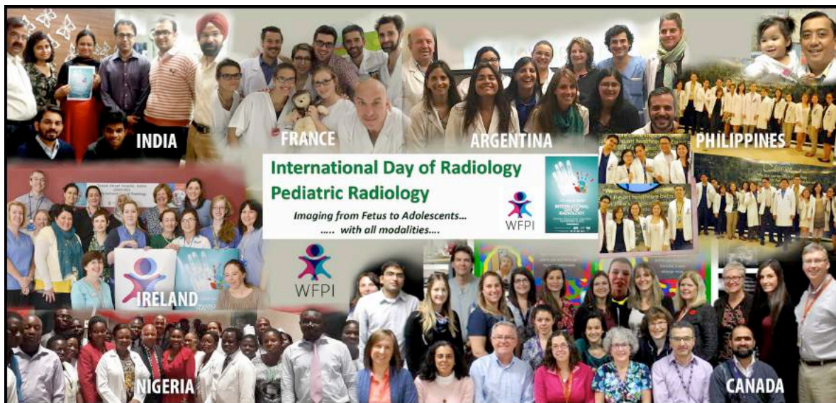
Collage of photographs of radiology staff around the globe, taken during the International Day of Radiology 2015 Global Wave

From this communication and collaboration, all else flows.