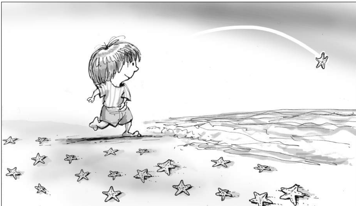
Introductory drawing from the paper “Saving the Starfish: World Federation of Pediatric Imaging (WFPI) development, work to date, and membership feedback on international outreach” Pediatric Radiology, April 2016

We have seen this wish becoming action since our launch in 2011, with plenty of opportunities ahead. On the review of the available member societies’ opinions and the accomplishments to date, we believe that WFPI can go even further. Moreover, the worldwide celebrations of the 2015 International Day of Radiology demonstrated true unity of purpose in this global drive. Communication and collaboration delivered with such passion and pride can only spur WFPI on to achieve its goals.