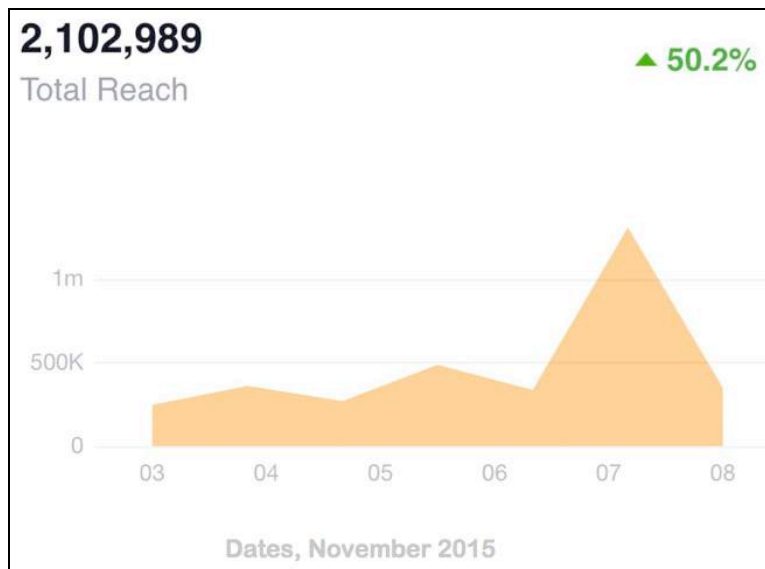
Figure 3: Radiopaedia / WFPI case reach, International Day of Radiology 2015

Reaching on average over 1000 people per post on Facebook in 2015, the production of online cases has been an important part of WFPI's online educational work. The partnership with Radiopaedia.org for the International Day of Radiology 2015 celebration, involving a series of international pediatric imaging cases run online, showed that WFPI's educational materials can reach remarkable numbers of interested learners through social media via strategic partnerships.