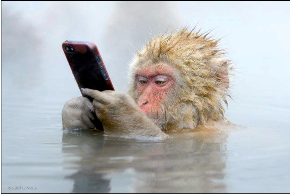
Smart phones: who doesn't have one?

It bears noting that when tele-reading passes through an NGO (MSF/DWB, Imaging the World), with project-dedicated, remunerated staff onsite, telereading flow can be considerable higher. Is this "middle man" a necessity or can we expect a steady flow of tele-expertize referrals when working directly with MOH/other facility staff?