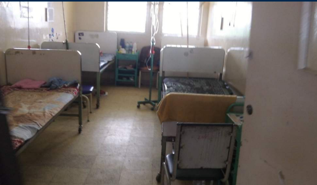
Regular ped hospitalization room ( 4 bed)