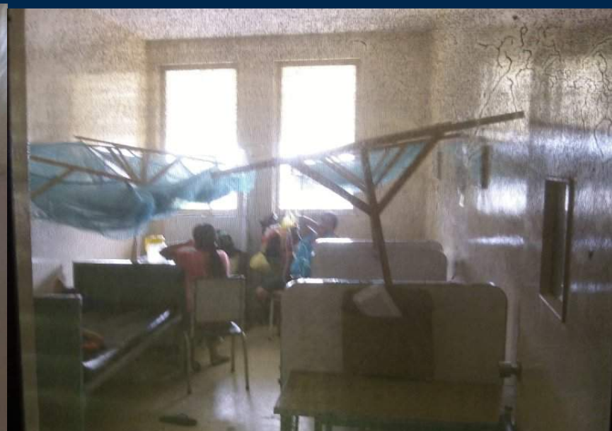
Room for patients with malaria